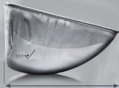
Depth of the bucket The bucket is placed vertically, and measured from the front, and in