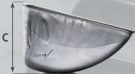
Bucket height Total height in the back