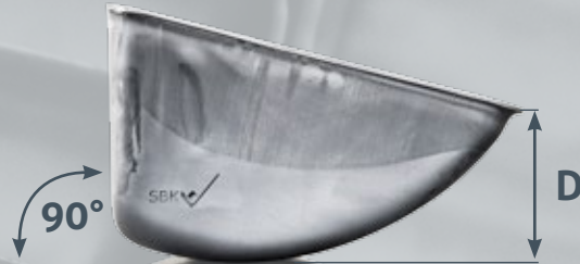
Bucket height front The bucket is placed vertically, and measured from the front and down