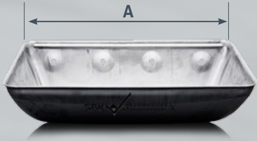
Width of the bucket Outer dimensions