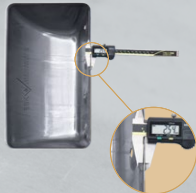
The thickness is measured with a caliper